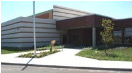
Trotwood-Madison Early Learning Center