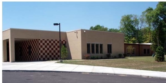
Westbrooke Village Elementary School