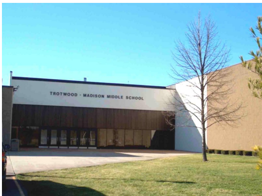
Trotwood-Madison Middle School