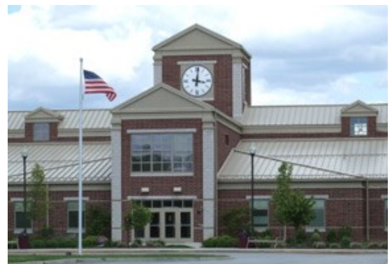
Trotwood-Madison High School