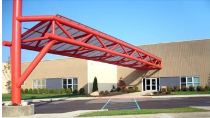
Trotwood-Madison City Board of Education Building