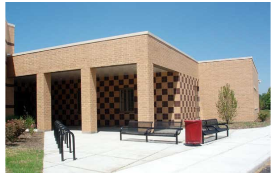
Madison Park Elementary School